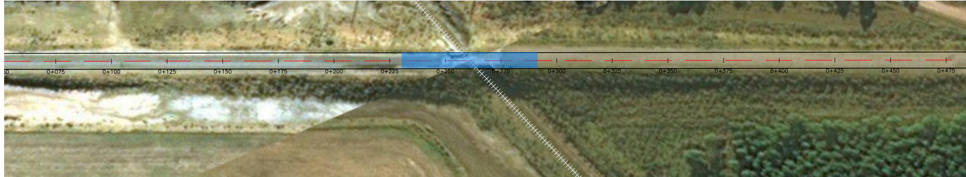
PLAN VIEW SCALE 1:1000